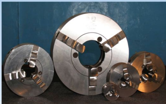
Self-centering lathe chuks