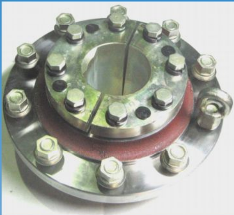
Center of a wheel